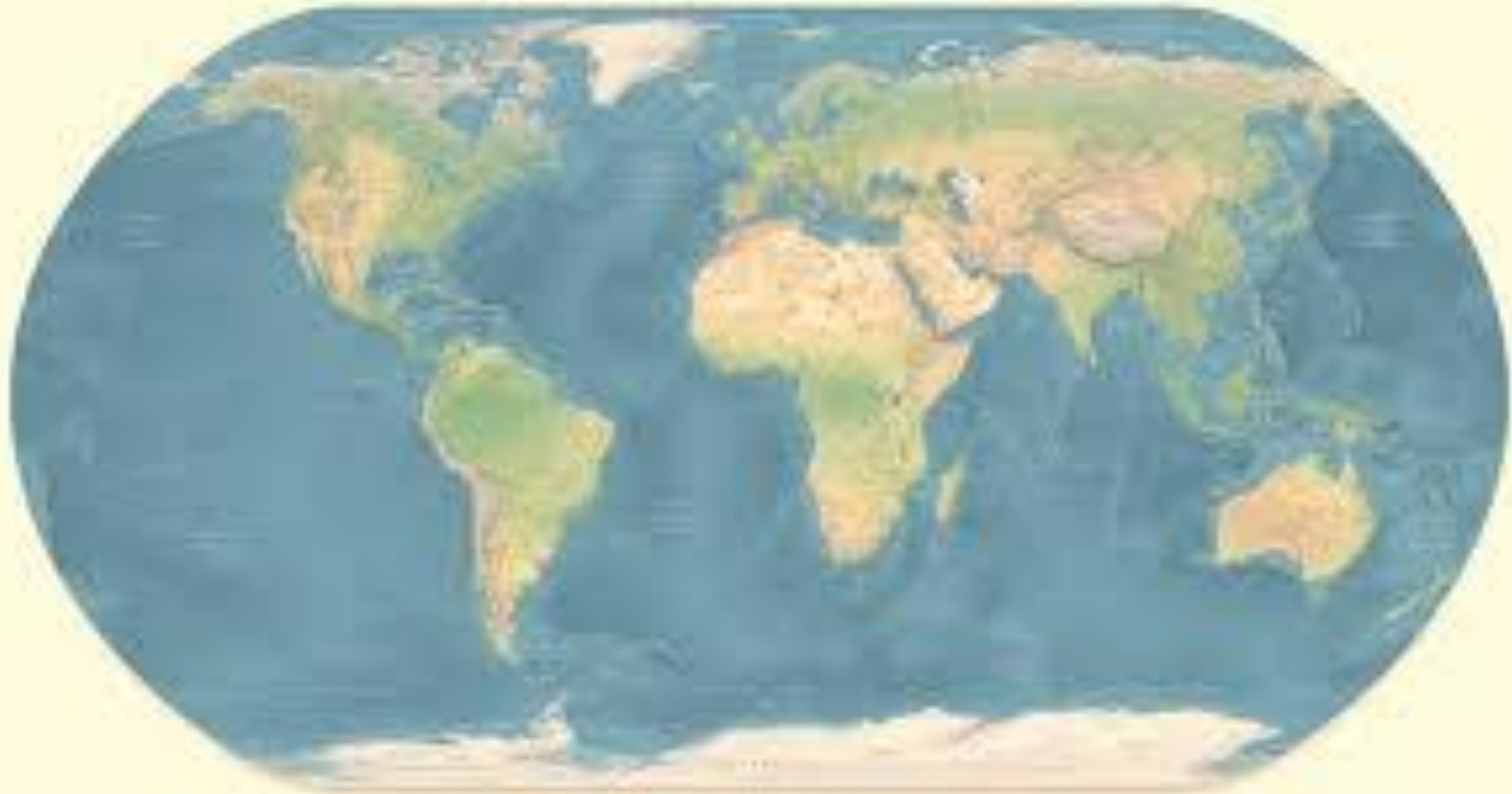
Physical Map of the World